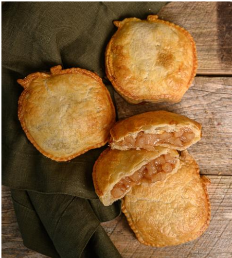
APPLE HAND PIE