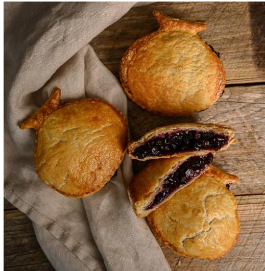
BLUEBERRY HAND PIE